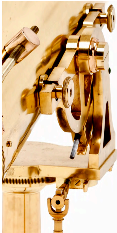
Rear view of the stacked adjuster connections

Stacked slow-motion adjusters make the use of two adjuster rods awkward with the top rod lying near direct on the lower adjuster; perhaps using a single adjuster was the original configuration, or alternatively a small knurled brass extension rod could have been used similar to TRE8.